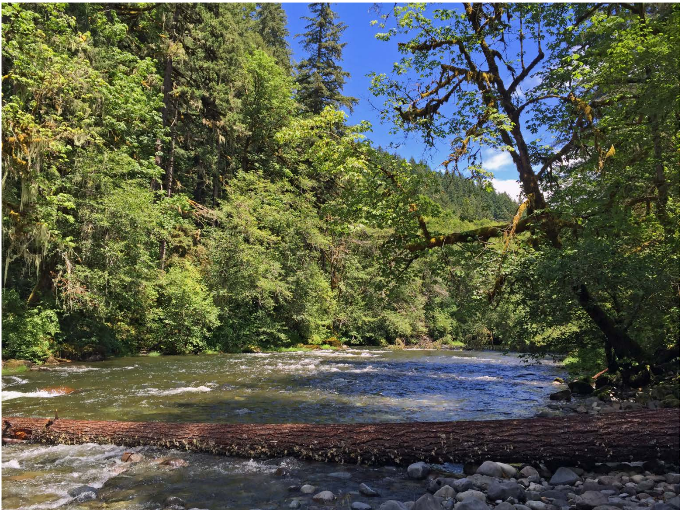
A tree lies in the Little North Santiam River, having fallen in from the adjacent riparian forest.