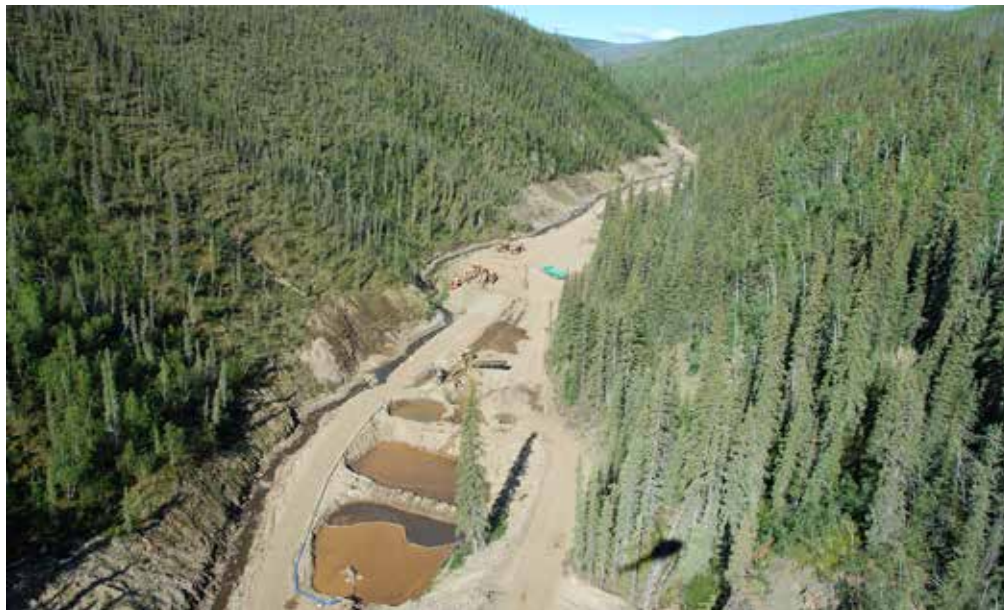
Photo showing watershed-scale disturbance within the floodplain (Franklin Creek, Fortymile Wild and Scenic River).

MESSAGE FROM THE PROJECT TEAM: This project addressed a fundamental management question that could not be fully answered with existing science and available data. BLM Alaska recognized the limited resources available and teamed up with the National Operations Center to facilitate data collection through the AIM Strategy's NAMF. The Eastern Interior Field Office's success has led to the development of a NAMF implementation plan for Alaska, which lays the foundation for statewide deployment of aquatic AIM and the integration of AIM-based objectives into resource management plans.