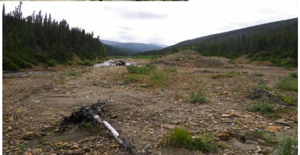
Photo showing lagging recovery timeframes, where full recovery has yet to be realized approximately 20 years after mining ceased (Bachelor Creek, Steese National Conservation Area).