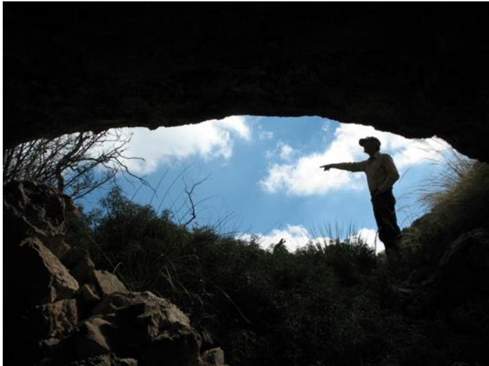
Jim Goodbar smiles as he observes short-faced bear bones in a cave.