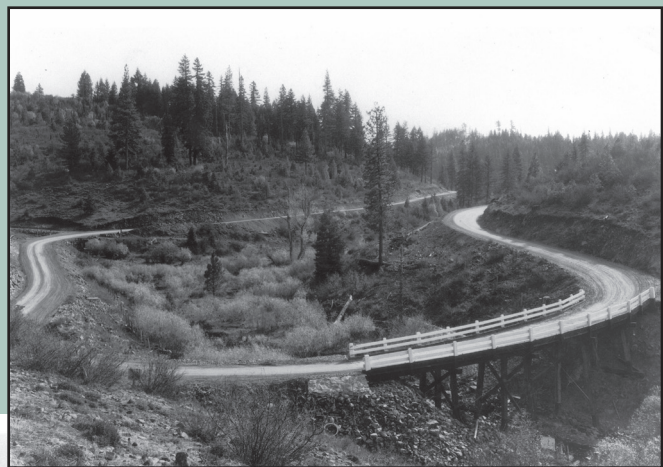
State Highway 66 at Keene Creek Reservoir circa 1929

Approximately 53,000 acres of public land in the vicinity of the Greensprings are managed as the Cascade-Siskiyou National Monument in recognition of the area's outstanding natural diversity. The Monument lies at the convergence of the Cascade and Siskiyou mountain ranges. The collision of these mountain ranges, containing some of the youngest and oldest rocks in Oregon, has resulted in a great variety of plant and animal species. Many visitors to the Monument will access the area by first traveling through the Greensprings community along Highway 66.