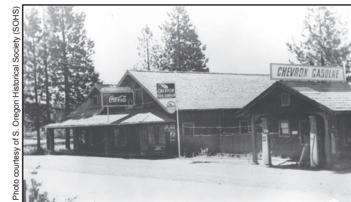
Lincoln, Oregon circa 1949