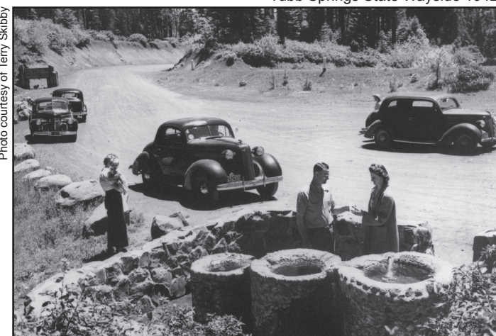
Tubb Springs State Wayside 1942