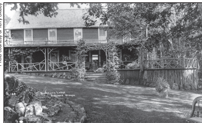
Buckhorn Springs circa 1910

Steeped in history, sights along Highway 66 offer a glimpse of the past. Many businesses on the Greensprings carry on the tradition of offering services to contemporary travelers.