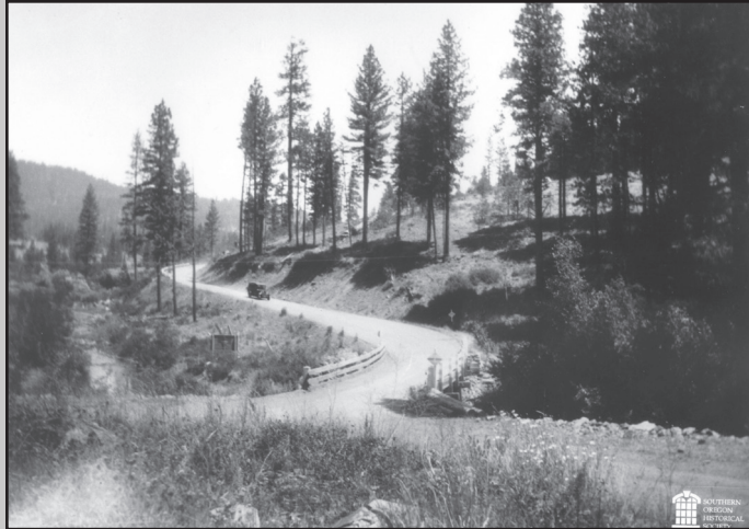
State Highway 66 at Keene Creek Reservoir circa 1929