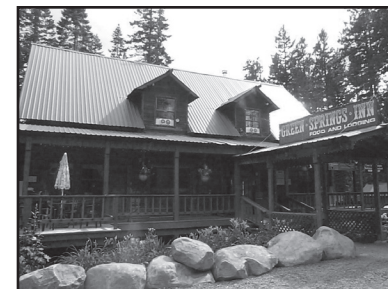
Present-day Green Springs Inn