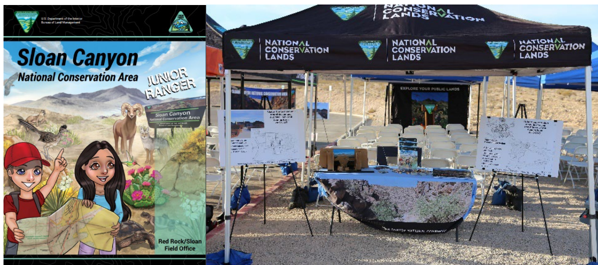
Jr. Ranger book and groundbreaking event for the Visitor Contact Station

The long-awaited groundbreaking event for the new Visitor Contact Station happened in FY24! Representatives from our non-profit partners, Tribal Partners, and partner agencies at the federal, state, and local level joined us to celebrate this milestone. The Sloan team is proud of the time and effort invested in cultivating these valuable relationships.