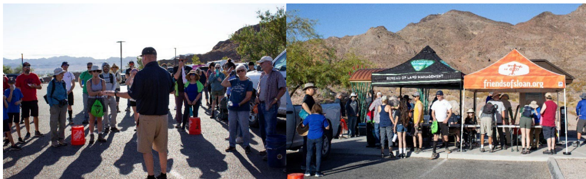
National Public Lands Day Event at McCullough Hills Trailhead.

Sloan expanded the reach of the monthly newsletter adding four more HOAs to the distribution list and posting it to the Sloan website. Sloan staff also supported the annual Gathering for Our Mountains with Tribal Partners, federal agency partners, and Portland State University. The multi-day event brings together multiple generations of Southern Paiute to share cultural skills and renew relationships with one another and the sacred land. The organizers requested copies of the Sloan Jr. Ranger book for each participant, who offered lots of positive feedback and appreciation for the care taken to create the book.