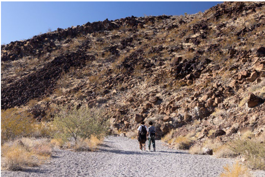
Visitors enjoying the Petroglyph Trail.

On a fun (and slightly stressful) note, the Former Director of BLM and other BLM leaders enjoyed a guided hike in Petroglyph Canyon this spring. The BLM's Executive Leadership Team also came for a visit to learn about the challenges of managing public lands in the wildland/urban interface.