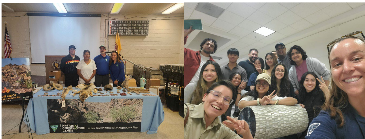
Jr. Ranger Book event with the Moapa Cultural Committee and the UNLV Architecture Class.

Sloan staff also built on existing partner relationships. Staff hand delivered over 2,000 copies of the new Jr. Ranger book to four different Tribal Partners and hosted events for Tribal youth during two of those visits. These events received a lot of positive feedback for making the effort to visit them. The Friends of Sloan Canyon (FOSC) remain a vital partner for the NCA. Volunteers donated over 800 hours assisting visitors at the temporary Visitor Contact Station and supporting multiple outreach events, including our annual Earth Day and National Public Lands Day events. Sloan continued the work with West Henderson Library in hosting monthly Speaker Series. Partners are essential to the work at Sloan Canyon.