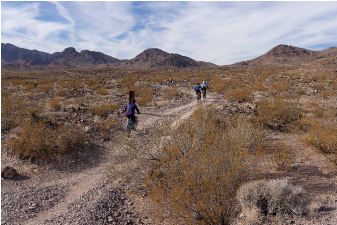
Mountain bikers enjoying a ride on a designated trail.

On more administrative notes, the Sloan staff gritted through a host of challenges associated with the start of the VCS construction, including closing and moving all the contents of the temporary office space and prepping for reroutes of popular trails around the NCA. The Sloan team is also grappling with the question of how the NCA will be funded long-term.