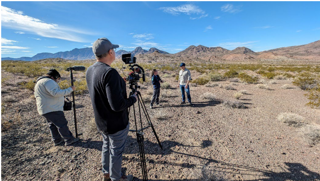
Filming episode of Outdoor Nevada focused on unauthorized trails.