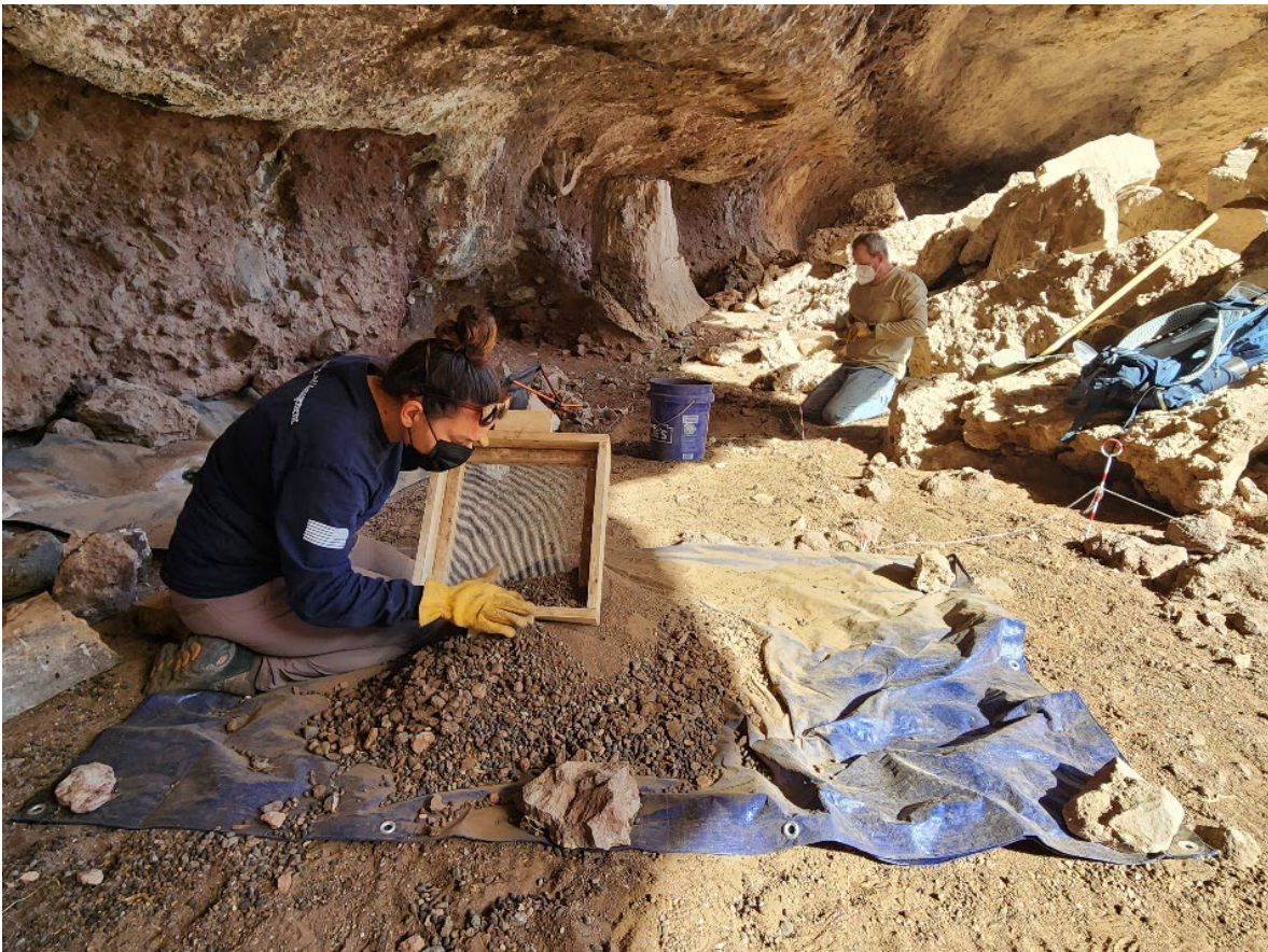
Sifting at Dripping Springs testing excavation.

Sloan's Eclipse Event in October of 2023 was a huge success. Attendees enjoyed the interpretive offerings and the free viewing glasses to safely enjoy the moon eclipse the sun. Building on this successful event, the Sloan interpretive team is planning Night Sky Training for FY25 in partnership with the NASA's Earth to Sky. Sloan also continued the well-attended Speaker Series with partner, West Henderson Library. This year, the series covered a broad range of topics with speakers from various federal, state, and local agencies and non-profit organizations.