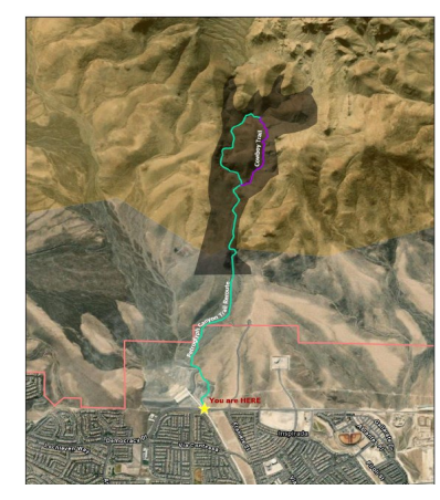
Petroglyph Trail Reroute Map

Education Tip: Join us on April 17th at 10:30am at the West Henderson Library for Looks that Kill: The Risks of Landscaping with Non-Native Plants at the Wildland-Urban Interface. Sign-up for the event here.