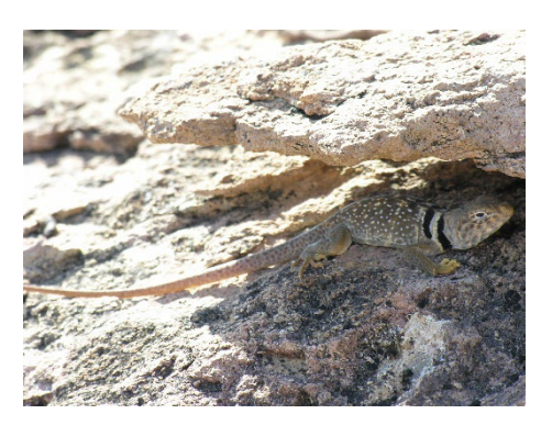
Great Basin Collared Lizard

Etiquette Principle: As spring wildflowers begin to bloom, please remember to take only pictures. Picking and removing flowers from Sloan Canyon not only takes the beauty away from other visitors but also impacts wildlife. Flowers are important source of food for bugs, birds, and reptiles. Love the beauty of native plants? Head to your local nursey and see what native plants you can add to your yard. Some of our favorite native wildflowers are Brittlebush, Globemallow, and Firecracker Penstemon.