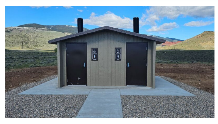
Concrete was poured at Outlaw Trails Vault Toilet