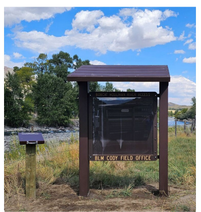
Kiosk at Bobcat Houlihan River Access