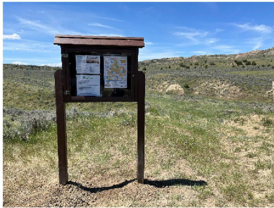
New kiosk at Fortification Creek Parking Area