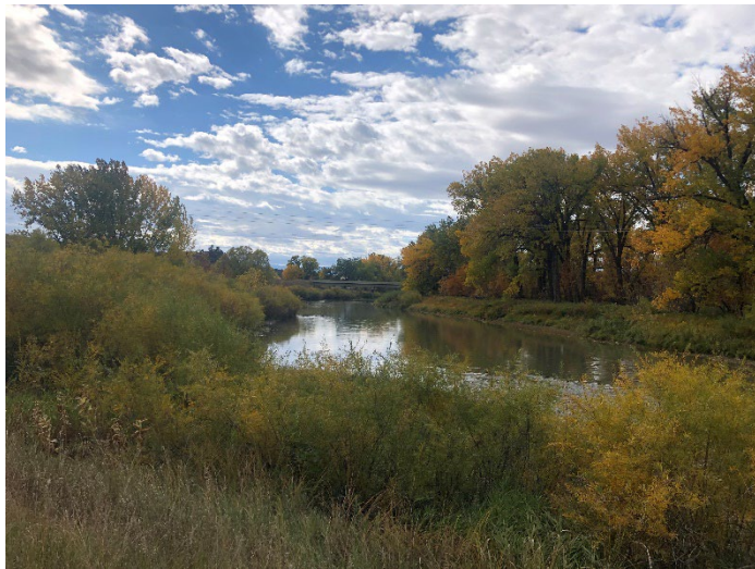
Buffalo Field Office

Approximately $30,000 for parking area design to serve the Welch Ranch SRMA. This unique area is popular year-round. A proposed river restoration project over the next few years would mesh nicely with needed improvements to the parking area.