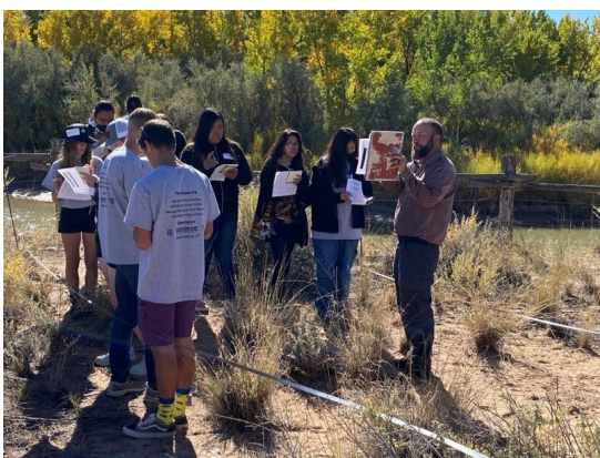
Students practice rangeland health trend study