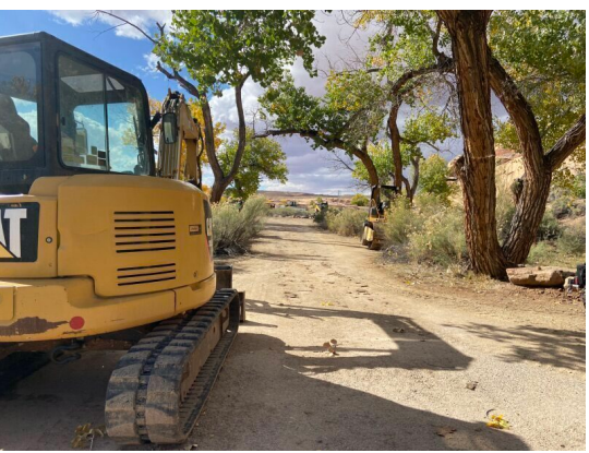
Machines constructing accessible trail section