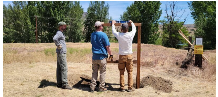
Staff Installed Bilingual Signs at Clarno