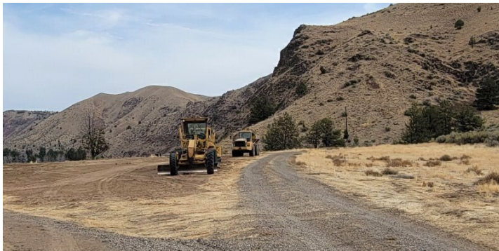
Construction Begins at Priest Hole Campground