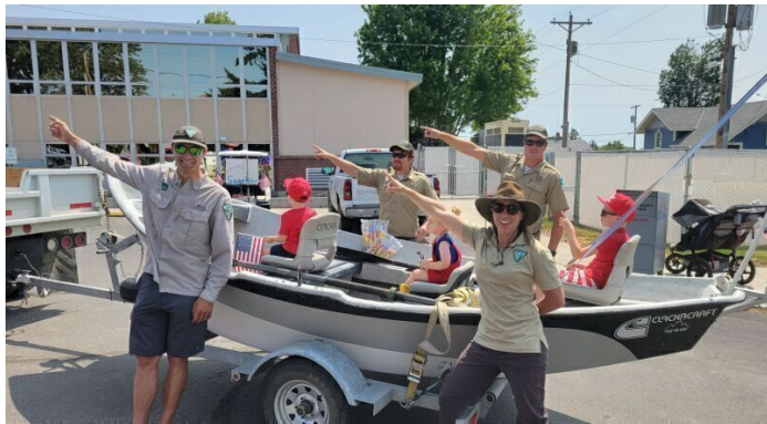
Rangers at the Fourth of July Parade in Condon