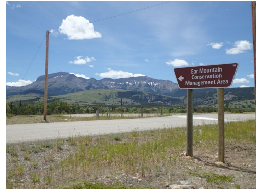
Ear Mountain Conservation Management Area

The Lewistown Field Office (LFO) administers approximately 30 special recreation permits for big game hunting, fishing, and aircraft shuttle services. Authorized aircraft shuttle businesses provide transportation to BLM lands that are otherwise inaccessible to the public. By recognizing the value of the outfitter industry, LFO is supporting community values and promoting the quality of life inherent of Central Montana. In FY24, LFO did not utilize fee program revenue to administer commercial use permits.