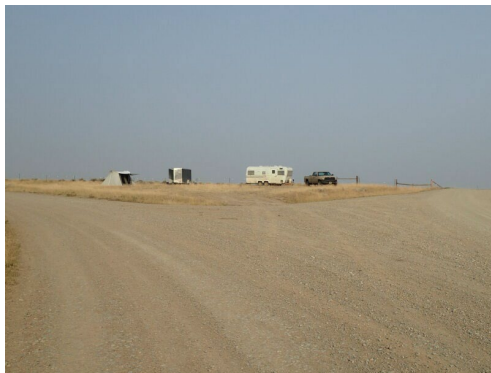
Valentine Road Public Camping

Two new accessible vault toilets with parking areas, access routes to restrooms, and interpretive information signs - $80,000.