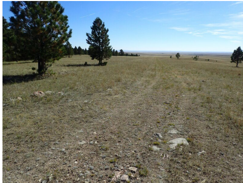
Durfee Hills Aircraft Access