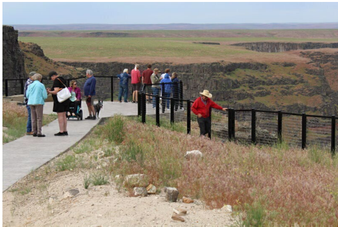
Safety fence at the Bruneau Canyon Overlook

Purchase supplies such as dry bags and dry suit repair for continued monitoring of the Bruneau and Jarbidge Wild and Scenic Rivers.