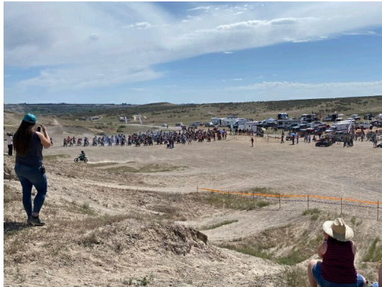
Start of Magic Valley Motocross Race