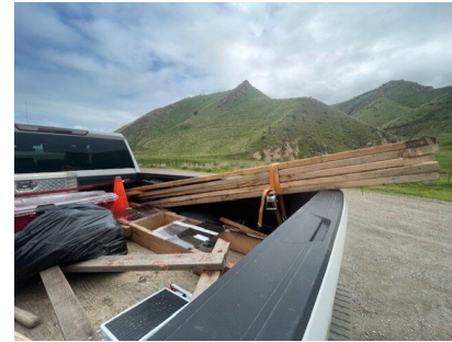
Ranger on Patrol