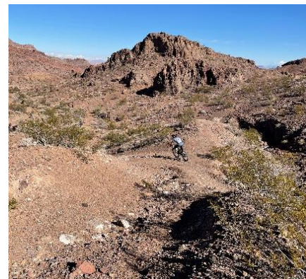
A mountain biker on the McCullough Hills Trail.