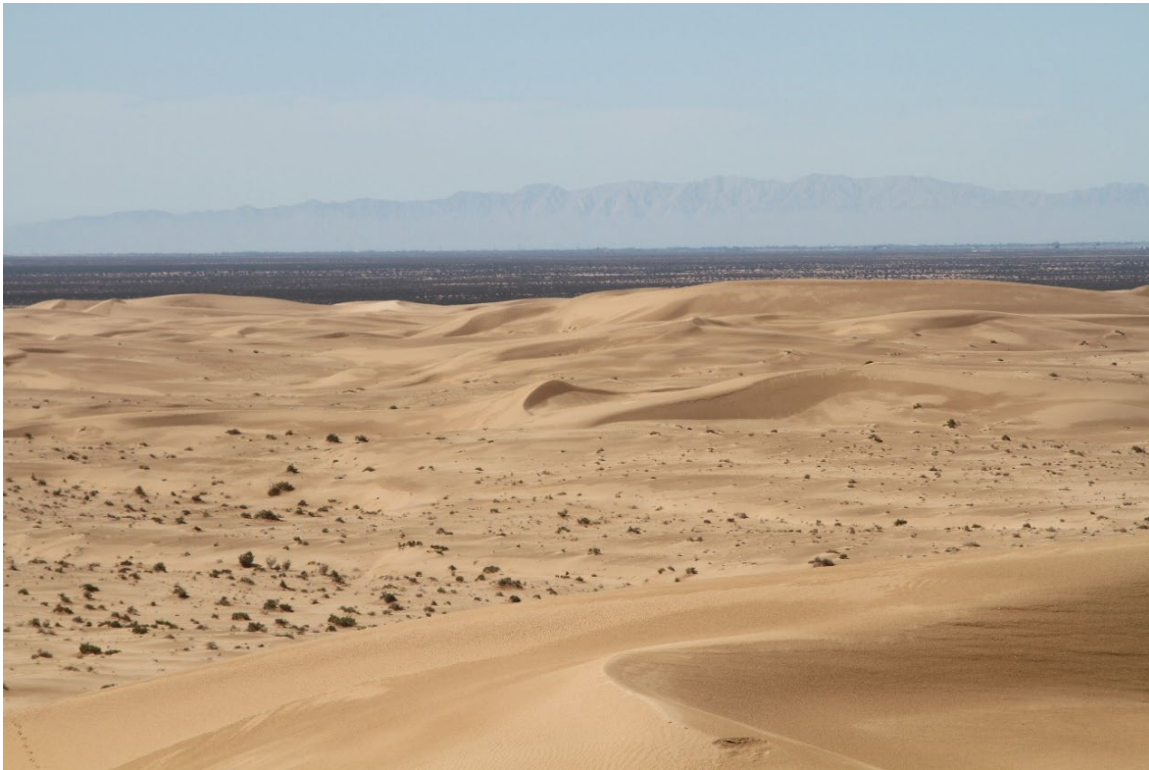
ISDRA Dunes landscape picture

There is no proposed change as to how “towed-in” vehicles – whose use is only for cross country travel within the ISDRA – would be managed. Once street-legal towed-in vehicles leave the sand on their own power, they will continue to be required to hold a separate ISRP permit.