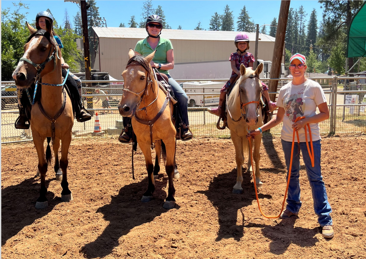
Nevada County Fair