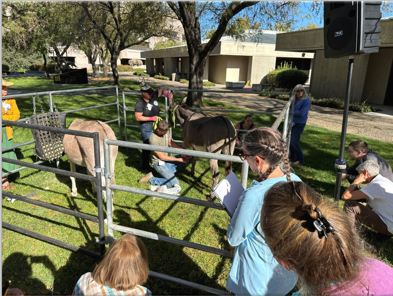
Donkey Welfare Symposium, UC Davis