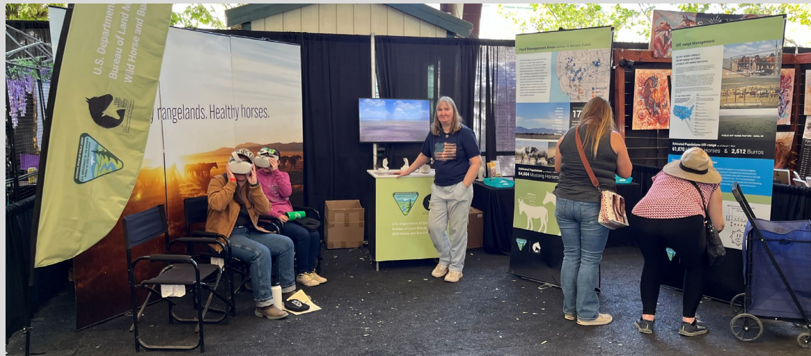
Western States Horse Expo