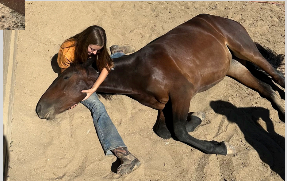
Willow napping with her adopter.