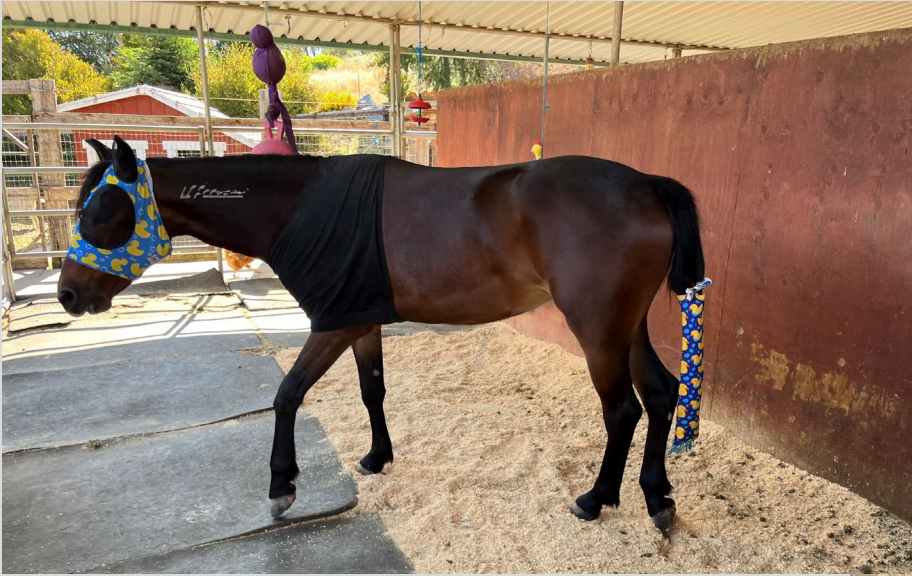
Willow decked out in fly protection