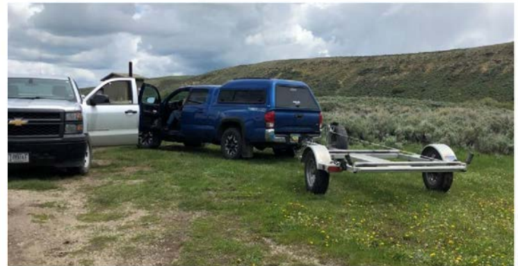
Contacting Fishing Guide and checking permits

Recreation fees from Warren Bridge Campground are primarily used to pay campground hosts a daily reimbursement for their living expenses. The campground hosts are on-site for the entirety of the season. They are available for customer support, education, security, provide minor maintenance needs, and provide an overall positive BLM presence to our visiting public. Additionally, recreation funds are used to purchase fuel for equipment for grounds upkeep and materials for facility maintenance.