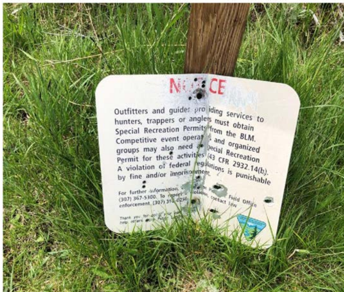
Replacement of vandalized and weathered SRP signs

Administration of Special Recreation Permit Holders as well as general land users. Accomplished through recreation site visits, patrols, visitor contacts, and the monitoring of recreation resources. $5,000