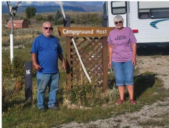
2023 Volunteer Campground Hosts