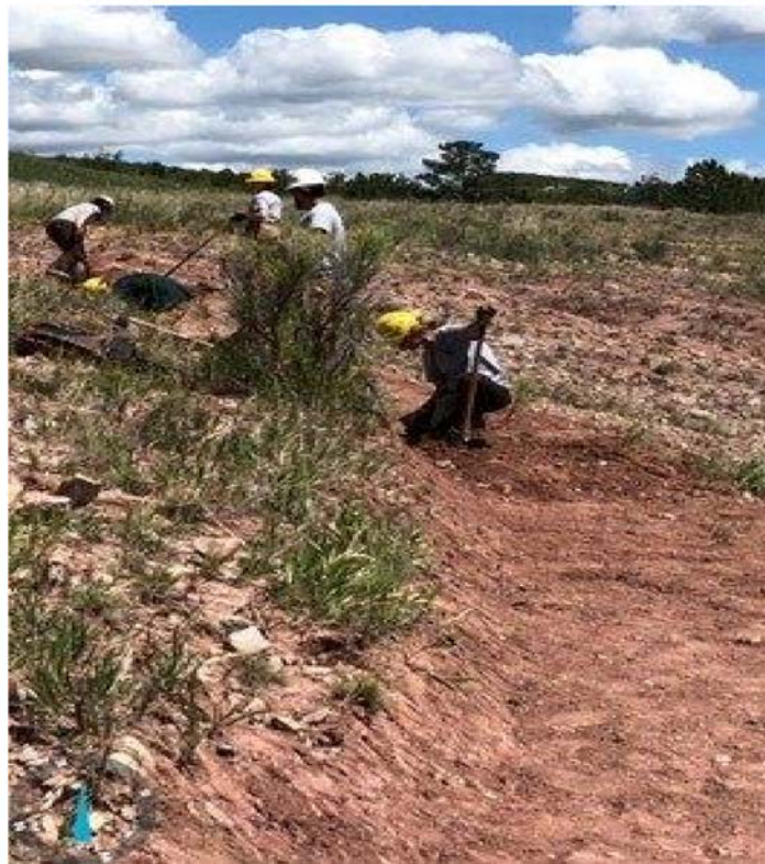
Planned trail work

Improvements to Old Quarry Trails $15,000