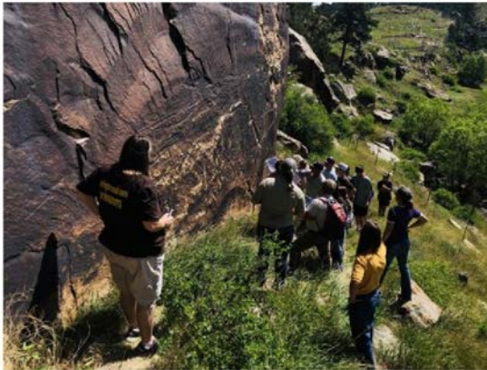
Students view rock art in Whoopup Canyon