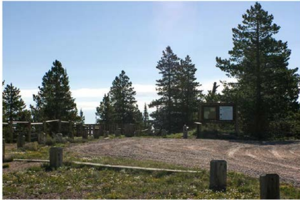
Iron Ranger at Rim campground