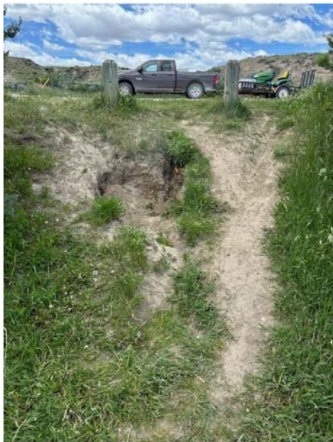
Planned repair of path at Golden Currant Site.