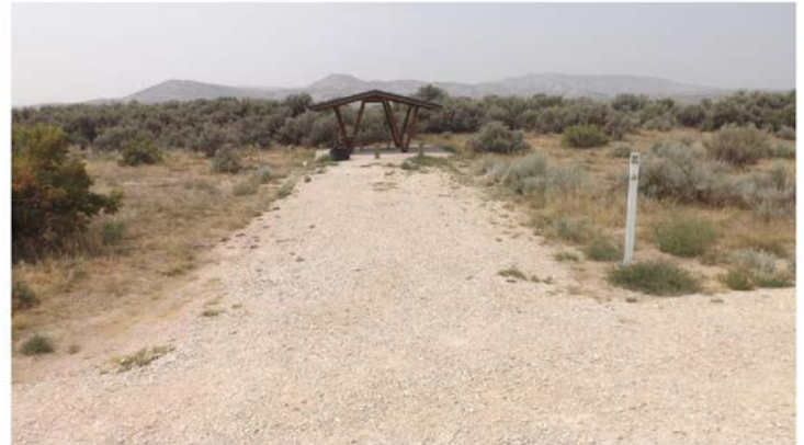
Campsite at Chalk Bluffs Campground

The Casper Field Office (CFO) obligated approximately $3,818.00 of FLREA dollars for two new Iron Rangers, at the Rim and Lodgepole campgrounds, on Muddy Mountain EEA. Muddy Mountain EEA hosts two developed campgrounds (Rim and Lodgepole) plus many miles of trails, in the Casper area. The old Iron Rangers were subject to vandalism.