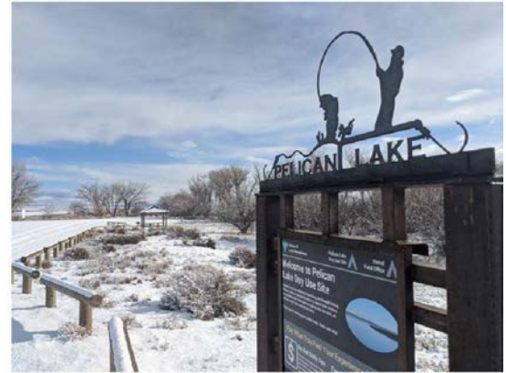
Pelican Lake Campground

The first phase of site improvements included the purchase of new shade structures, kiosks, and site furniture for the Fantasy Canyon site. These materials have been ordered and are awaiting site grade and drainage improvements for final installation. In FY24 BLM operations staff will improve drainage and level parking within the site to decrease maintenance costs, increase accessibility, and improve the visitor experience.