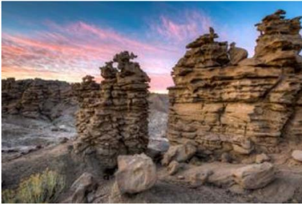
Geologic Features at Fantasy Canyon