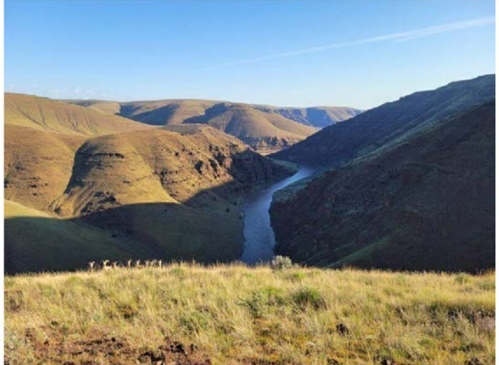
Sheep on the hillside above the John Day River.

Design and order boat launch kiosks - $1,000 Staff interpretive events - $1,000 Manage 2,000 boater permits - $2,000 Collection and counting of fees - $3,250 Resource protection and patrols - $20,000 Recreation site maintenance and supplies - $17,000