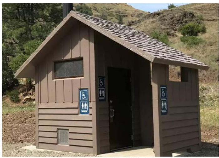
Shooting Range Vault Restroom

Alvord Desert refuse contract - $10,000 Trail crews, designated trail maintenance - $25,000 Vault toilet purchase for shooting range - $30,000 Floating dock purchase, Fish Lake - $10,000 District vault restroom pumping contract - $30,000 Rec site animal control - $8,000 Rec maintenance staff labor - $25,000 Rec operations and maintenance supplies - $15,000 Rec kiosks and signs - $12,000