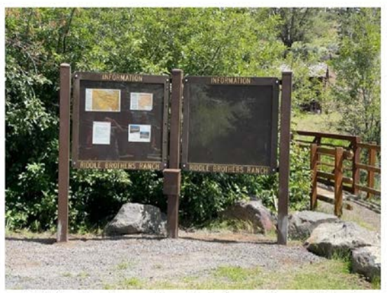
Riddle Brothers Ranch Informational Kiosk