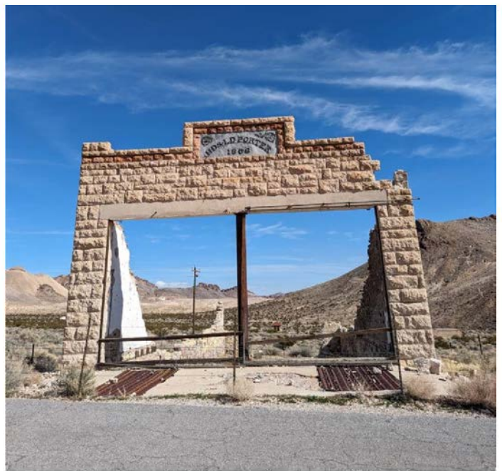
The Porter Building at the Town of Rhyolite

Restoration and reinforcement of the Historic Town of Rhyolite. Multiple buildings need restoration and reinforcement, or they will collapse in the years to come. Estimated project cost begins at $10,000.00.