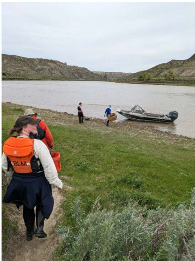
Recreation staff maintain a riverside campground.