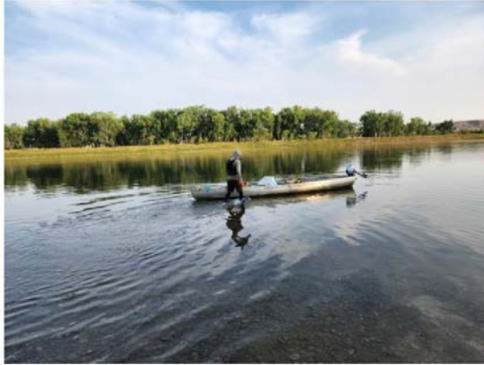
Recreation Staff River Patrol

The BLM Upper Missouri River Breaks National Monument (UMRBNM) had three dedicated volunteers that helped to maintain, monitor and address visitor needs in the summer of 2023 at Coal Banks Landing & James Kipp Recreation Area. These campground host volunteers helped throughout the summer to ensure monument staff were up to date on matters going on at these active sites while maintaining utmost professionalism when working with the public. Fee revenue helped support the living expenses.