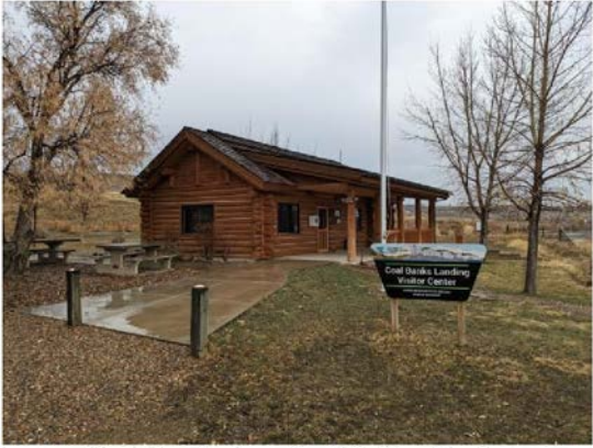
Coal Banks Landing Visitor Center