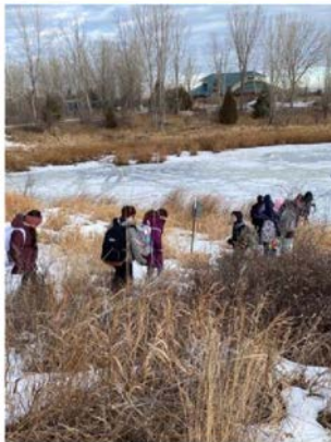
4th Graders Field trip