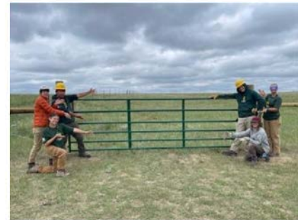
MCC gate completed

Funding was used this year to help host 4th graders to our sites. The ANTS program stands for Audubon Naturalists in the Schools. ANTS provides year-long, field-trip-based programming to elementary school students in Billings and the surrounding area. Audubon worked with more than 80 individual ANTS classrooms in Billings and the surrounding area. Approximately 29 schools participate in this program, through an agreement with the BLM.