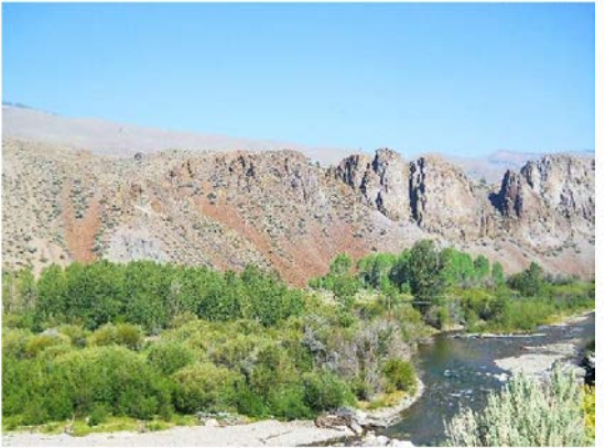
Overlooking the Little Boulder Recreation Site.