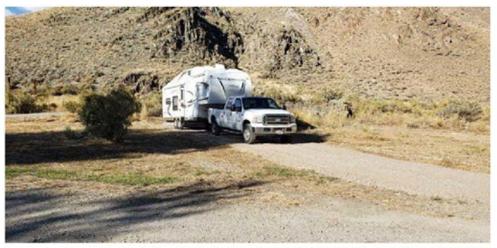
New back-in campsite at Bayhorse Recreation Site

In 2024, the Challis Field Office anticipates completing the following projects: