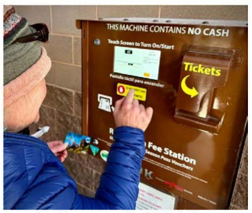
Testing an onsite ROK station