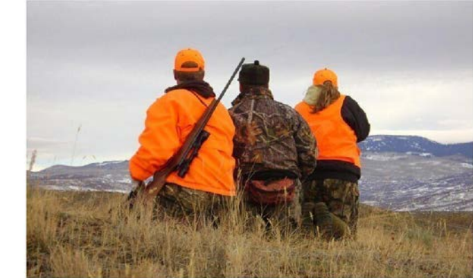
Elk hunters with guide