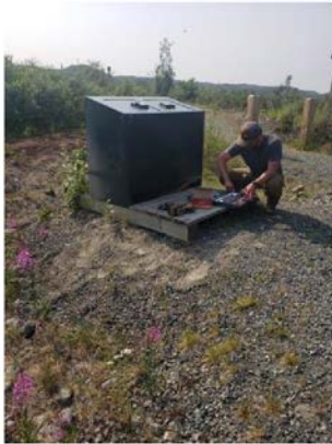
Bear Proof Garbage Can Replacement