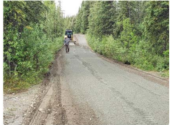
Brushkana Campground Entrance Road Resurfacing