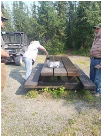
Routine Annual Site Maintenance