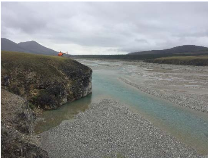
Helicopter SRP Monitoring, Squirrel River SRMA