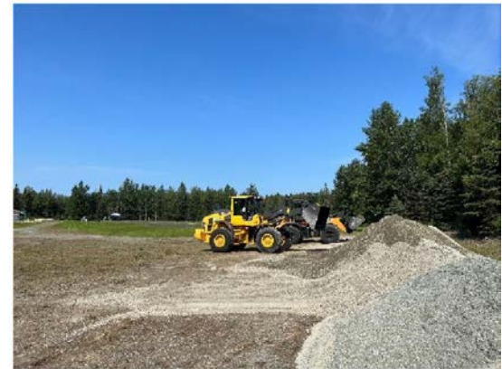
Preparing for Trail Work at Campbell Tract SRMA

In 2023, Anchorage Field Office (AFO) began work on a Travel Management Plan and Resource Management Plan Amendment (TMP/RMPA) to address advances in recreation technology (E-bikes), increasing recreation opportunities, and conflicting management of the seamlessly connected route network of the Campbell Tract Special Recreation Management Area (CT SRMA) and adjacent park lands. The TMP/RMPA affects nearly 25 miles of routes. These routes provide nearly 500,000 visitors annually with extensive recreational opportunities in Alaska.