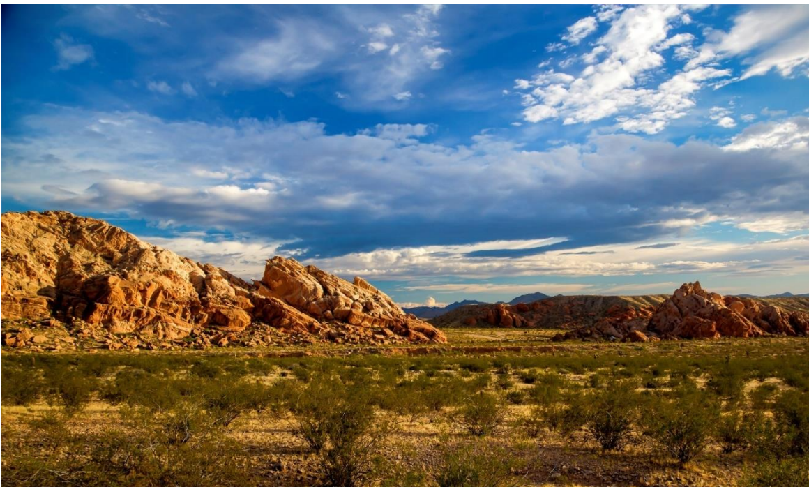
Whitney Pocket Area

Visitation to the Monument in Fiscal Year 23 was estimated at 77,590 visits, based on vehicle use data collected at dispersed sites. Most visitors enter the Monument along the Gold Butte Back Country Byway, staging or camping at Whitney Pocket, at the end of the paved portion of the Byway. From this location, visitors may access other undeveloped sites, continue to sightsee along the Byway, enter the adjacent Grand Canyon-Parashant National Monument, or drive to nearby trailheads which lead to non-motorized trails. The Whitney Pocket area is the most popular destination within the Monument, with less than half of the visitors at this location venturing further south to the more remote areas of the Monument.