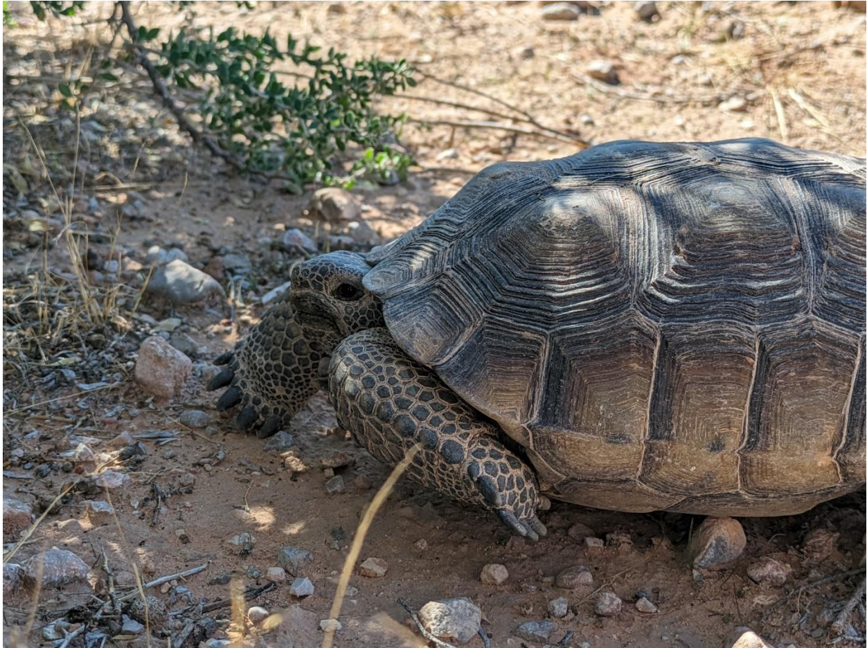
Mojave Desert tortoise.

With increase in visitation, there has been a commensurate increase in resource disturbance within existing dispersed camping areas, development of new dispersed camping areas, and an increase in improper disposal of human waste. Currently, all camping in the Monument is primitive and dispersed with little to no amenities or developed sites. A draft Monument Implementation Plan has been in development, which will help guide management direction for visitor use, and in turn reduce resource impacts, especially in site-specific areas that are receiving high visitation, like the Whitney Pocket area. Current management direction within the Monument is guided by the Las Vegas Resource Management Plan, Record of Decision (1998), and the Presidential Proclamation (2016).