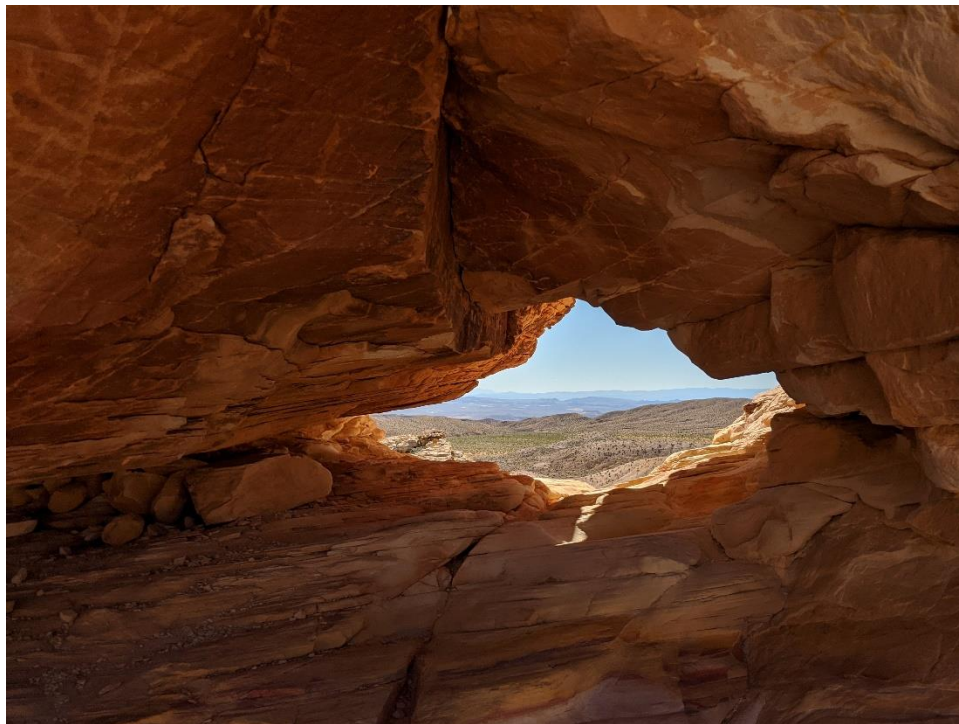
Falling Man window.

Our Monument Staff is dedicated to caring for and protecting not only the objects that are outlined in the Monument's Presidential Proclamation but also the less tangible, yet equally important, sentimental values that the Tribes, stakeholders, and public have placed on this remarkable stretch of desert. Like many of the visitors that venture into the Monument, we are equally in awe at its remarkable vastness, beauty, and diversity. We are encouraged by the increase in visitation each year and we look forward to future site-specific implementation improvements, so we can continue to provide exceptional opportunities while still protecting the diverse and irreplaceable cultural and natural resources for which the Monument was set aside. From the snowy peaks of the Virgin Mountains to the arid Mojave Desert bottom of the Whitney Pocket area, we are honored to be entrusted as your land stewards and public servants and we remain committed and dedicated to protecting this remarkable landscape, known as Gold Butte.