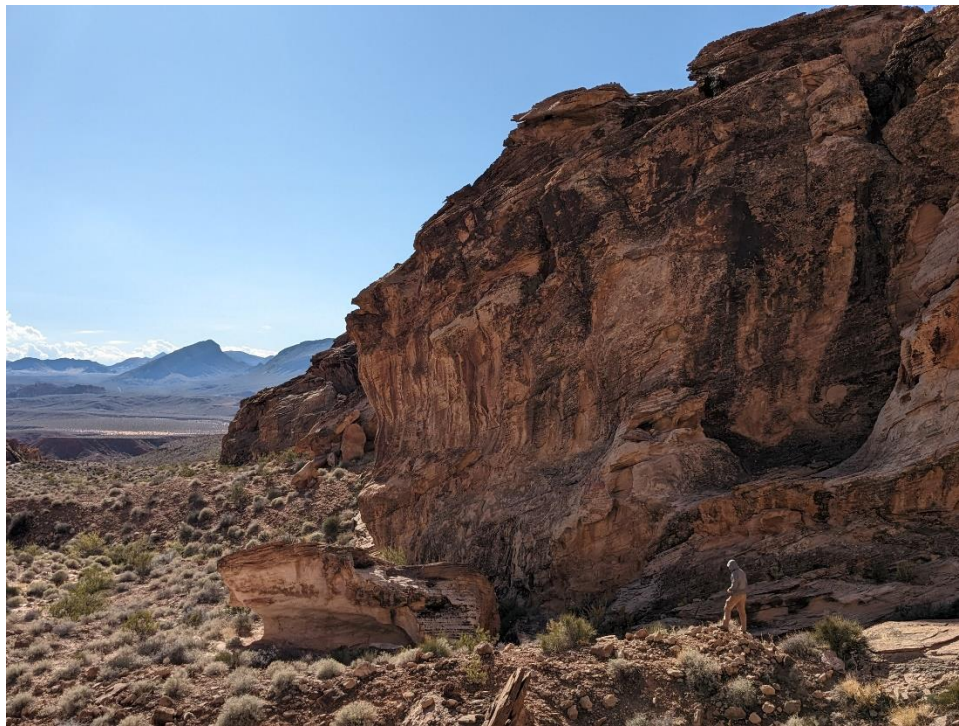
Hiker in the Bitter Ridge area.

Tribal input is solicited whenever any significant projects are proposed within the Monument. Input from affected Tribes is an important part of planning that allows for the considerate and careful execution of projects in this culturally-significant area.