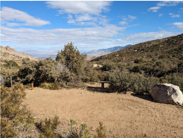
Cabin Canyon viewing area.

BLM and Clark County Department of Public Works collaborated to host a road repair project that aimed to provide maintenance to the 20-mile paved section of the Gold Butte Back Country Byway. This section of the Byway is severely deteriorating, but with the assistance of several volunteers over the course of two weeks, approximately 15 miles of pavement received much-needed pothole repairs.