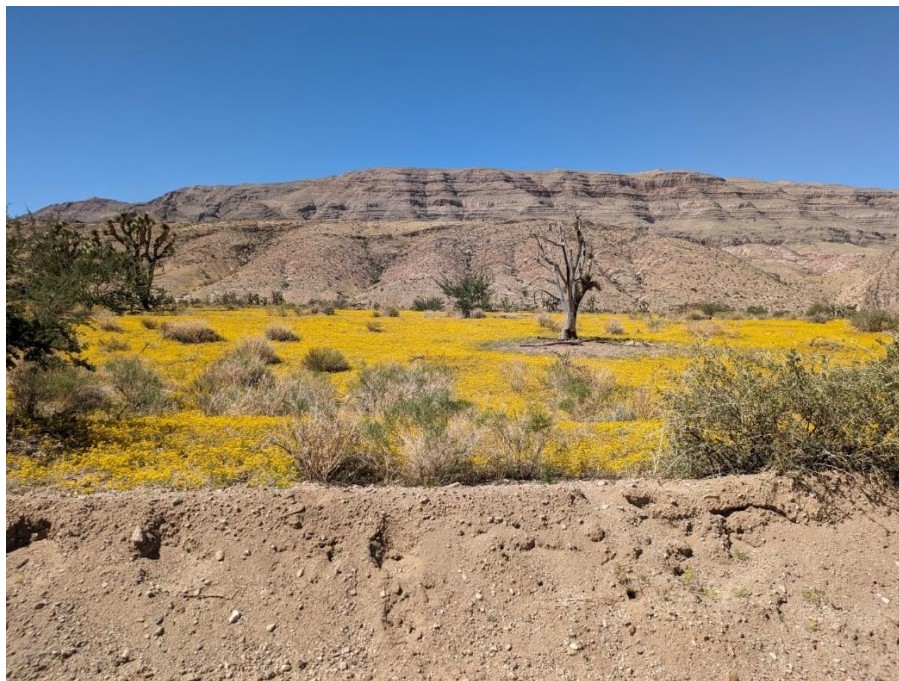
Cinchweed blooming in the summer.

Most development and large-scale utility projects are prohibited within the Monument. BLM will focus on maintaining or improving the current condition of the objects for which the Monument was designated. In most instances, this will require closely monitoring those objects as well as ensuring that anthropomorphic impacts are documented and addressed as soon as possible. In response to anthropomorphic impacts, several small-scale habitat restoration projects were completed throughout the Monument. BLM has developed a disturbance reporting program that provides volunteers and staff with tools to report instances of resource damage. Once reported, staff can coordinate treatments of sites to restrict further damage and allow for rehabilitation. By maintaining vegetation and soil conditions, the landscape is less susceptible to additional impacts from climate change. Plans to install facilities, such as restrooms or shade structures, will consider all reasonable protocols to reduce emissions during all phases of construction and installation, as well as during maintenance activities. Other considerations during planning will include minimizing impacts to soils, vegetation, water resources, and dust abatement.