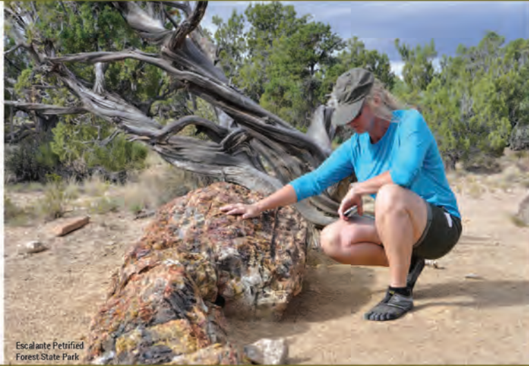
Escalante Petrified Forest State Park