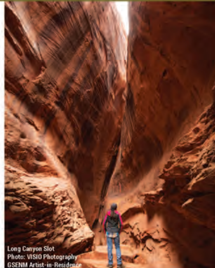
Long Canyon Slot Photo: VISIO Photography GSENM Artist-in-Residence