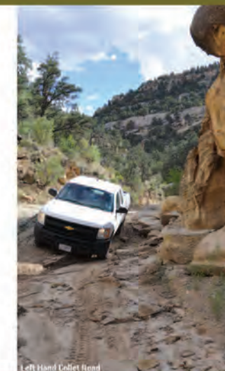
Left Hand Collet Road