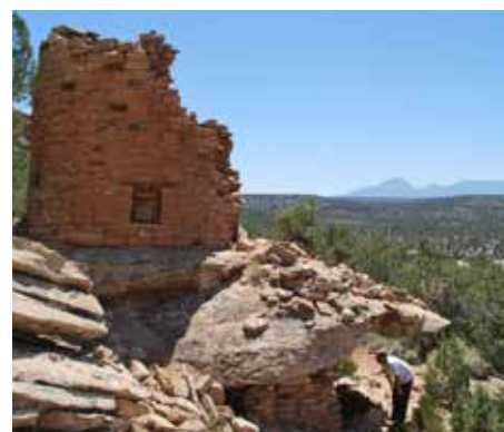
Painted Hand Pueblo

Built in the AD 1200s, Painted Hand Pueblo was a small village of about 20 rooms that still include faint rock paintings and petroglyphs. The designs of the ancient images have special meaning to Tribal descendants. In 2014, the Painted Hand Pueblo was placed on the National Register of Historic Places.