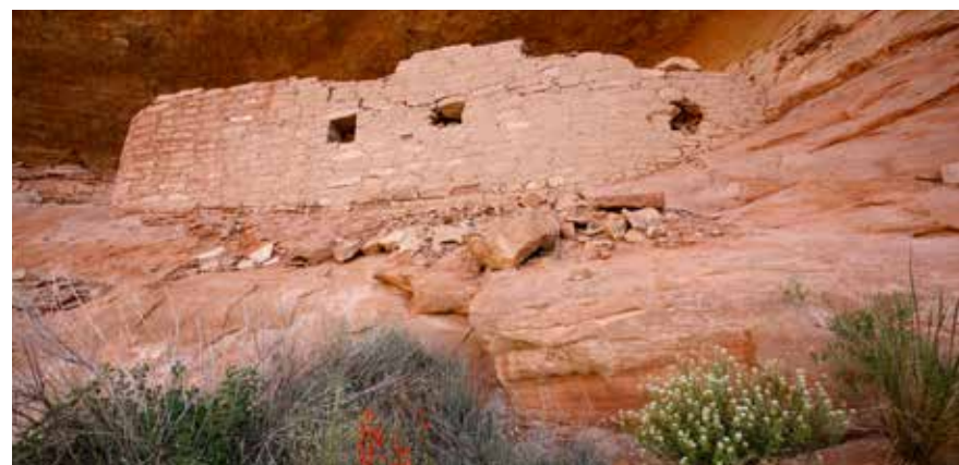
Sand Canyon Pueblo, Photo by ©Jerry Sintz

By AD 1275, Sand Canyon Pueblo was about three times the size of Cliff Palace (the largest pueblo in Mesa Verde National Park).