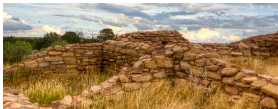
Lowry Pueblo

Dr. Paul S. Martin of the Chicago Field Museum of Natural History excavated Lowry Pueblo in the 1930s. In 1965, the BLM and the University of Colorado stabilized the masonry walls. In 1967, Lowry Pueblo was dedicated as a National Historic Landmark. Although the masonry was repaired for preservation and safety, Lowry looks much as it did when it was originally excavated.