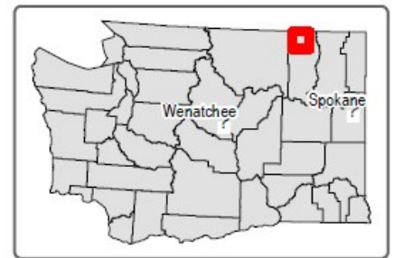
Map Area WASHINGTON STATE