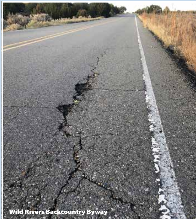
Wild Rivers Backcountry Byway