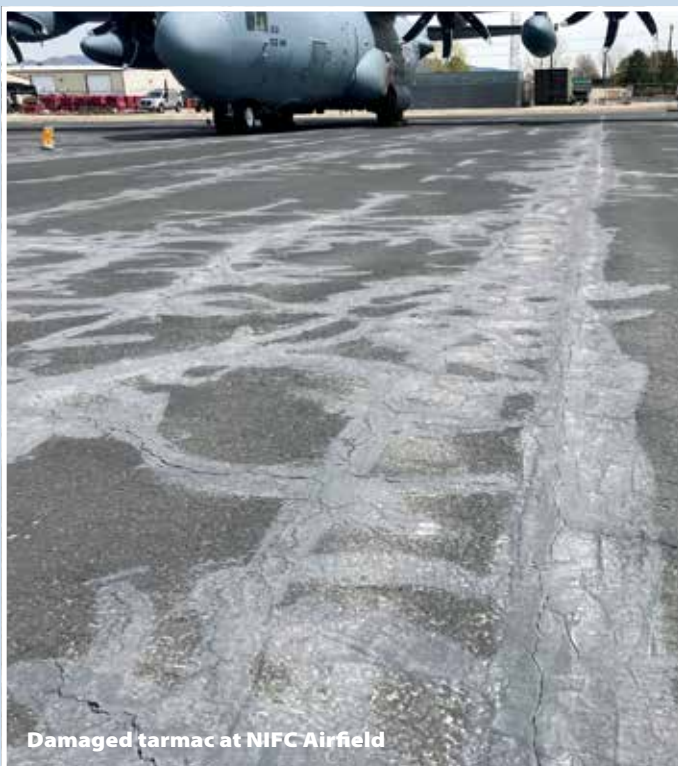
Damaged tarmac at NIFC Airfield