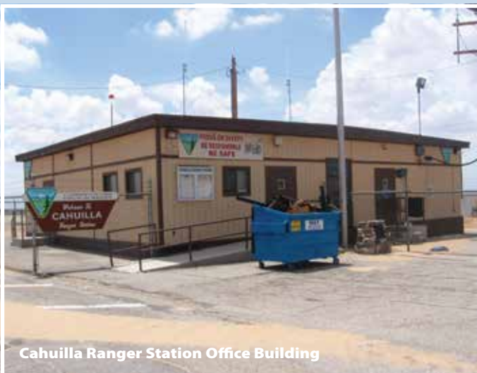
Cahuilla Ranger Station Office Building