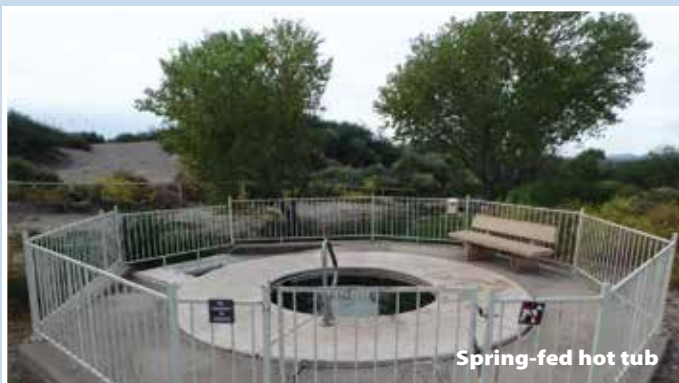
Spring-fed hot tub