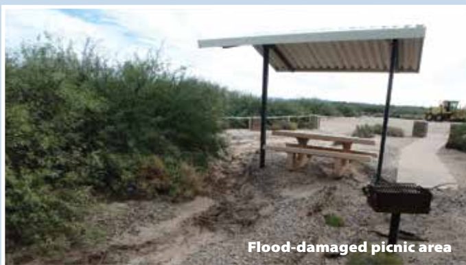
Flood-damaged picnic area