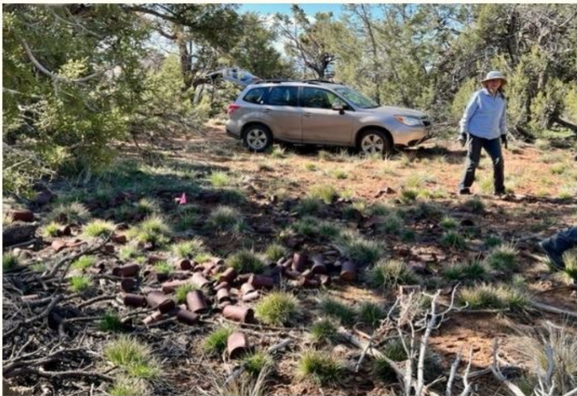
Volunteers recording a historic and modern trash dump on the rim of Hovenweep Canyon

This past Spring, a trained group of 14 devoted avocational archaeologists spent 195 hours assisting the BLM in recording a trash dump in preparation for an important clean-up project on the National Monument. Six different trash piles, dating between the early 1880's and 1980s, were located and thoroughly recorded. Trash types ranged from cans and bottles to tires and automobiles parts. Shoes, clothing, household goods, and construction materials were also present. The secondary nature of these cultural deposits and the absence of additional information potential preclude the site's listing on the National Register of Historic Places, allowing for the Agency's future cleanup of this uniquely beautiful location on Southwest Colorado's BLM lands.