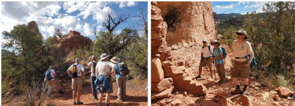
Cultural Site Stewardship Program volunteers on a training field trip in East Rock Canyon

Friends of Canyons of the Ancients National Monument