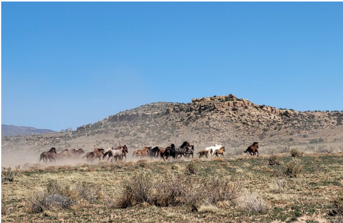
Trespass horse herd in the Flodine Park area of the Monument.

Trespass Livestock. In the fall of 2022, Monument and Tres Rios Field Office staff conducted a survey of trespass horses on Monument lands by foot and vehicle. 123 animals were observed. Because of the limitations of the survey technique, staff estimate that the total number of horses is higher, approximately 150 to 200 animals. While a variety of BLM specialists have documented trespass livestock, particularly horses, continually using the Monument for many decades, this was the first effort to quantify their numbers in recent years. Staff have concerns with the effects of the horses on vegetation, wildlife, cultural resources, and riparian areas. Most of the horses likely originated from adjacent Navajo and Ute Mountain Reservations with the occasional abandoned horse from other sources. Few, if any of the horses are branded, so determining ownership is difficult. Staff are working towards resolving the issue and have begun talks with the tribes to determine co-stewardship opportunities.