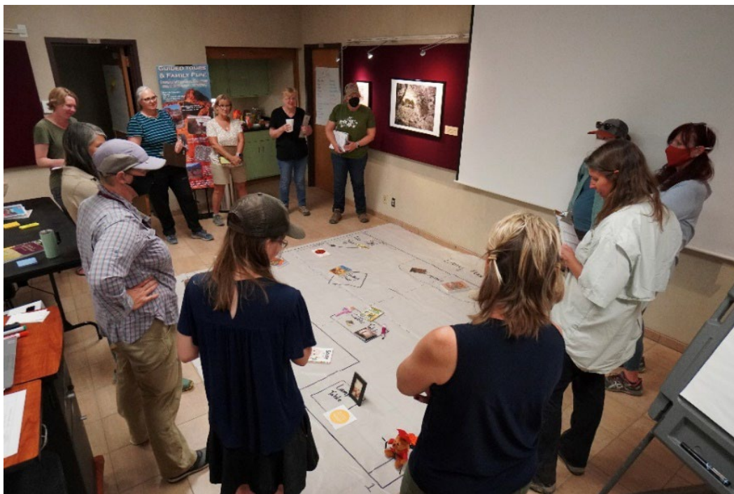
Project Archeology Workshop

The Project Archaeology lessons and educational activities can be accomplished in the classroom, on any landscape, or by visiting cultural sites. The curriculum highlights the cultural and natural resources found on public lands and demonstrates how to be effective stewards. Ultimately, teachers help students understand how archaeology is a way to connect the past with today.