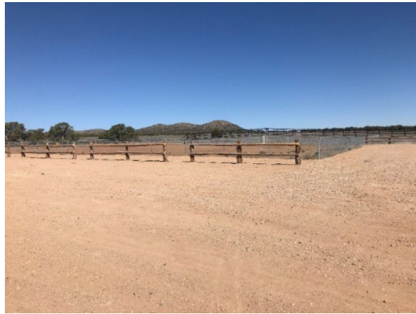
Three Peaks RC Car Track