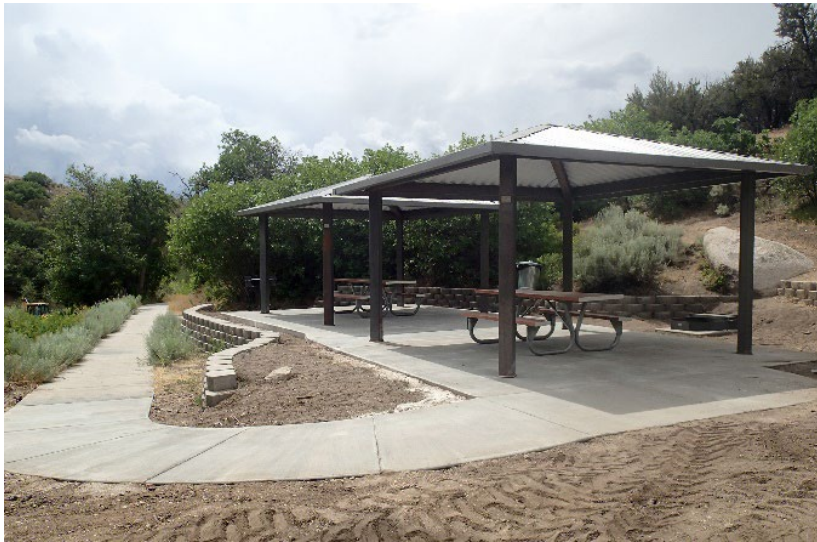
Rock Corral Day Use Site