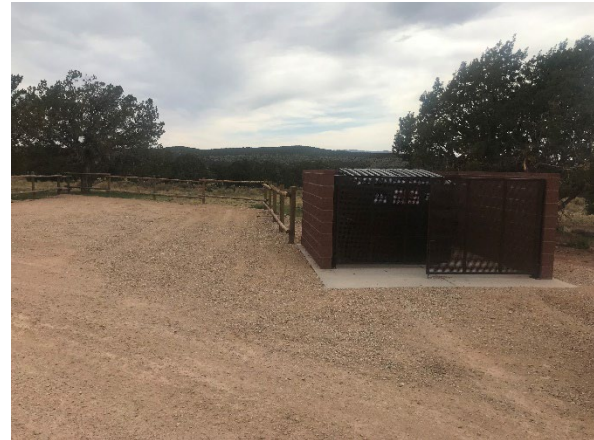
Trash Receptacle at Pyramid Ridge Campground