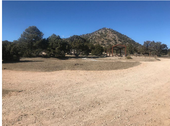
Group Site 1 at Rocky Peak Campground