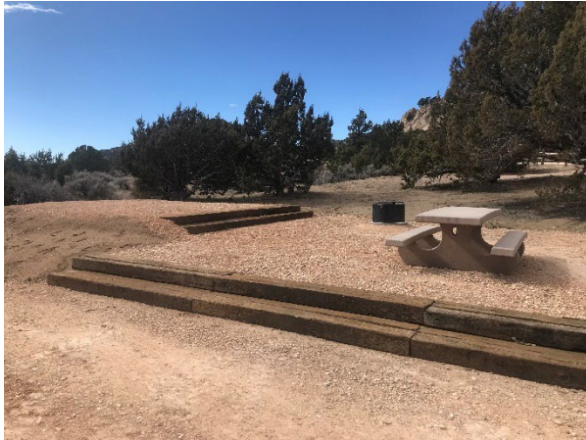
Individual Campsite at Rocky Peak Campground