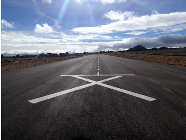
Three Peaks Model Port