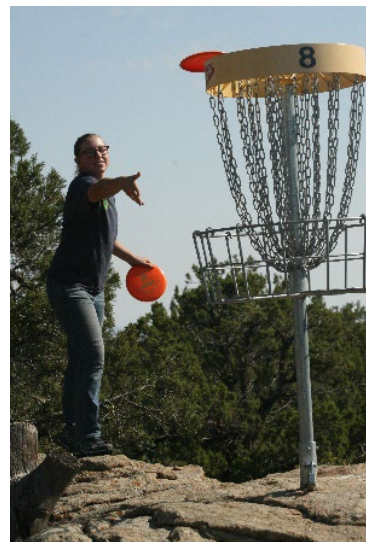
Three Peaks Disc Golf Course