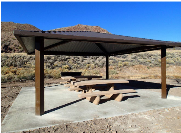
Large Pavilion at Hanging Rock Campground