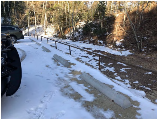
Aspens Trailhead Parking Lot at Red Grade

The BLM BFO has worked extensively with the Sheridan Community Land Trust (SCLT) to design ~5 miles of hiking and biking trails and one parking area/trailhead on the Red Grade parcel. The whole trail system falls on State, BLM and USFS lands, and the BLM is supporting SCLT with funds for trail construction. In 2022, SCLT completed construction of the Aspens Trailhead Parking Lot on BLM surface. This parking lot holds up to 10 vehicles and provides access to several hiking and biking trails.