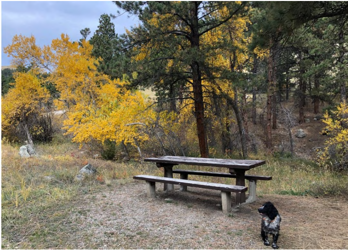
Mosier Gulch picnic table in need of repair