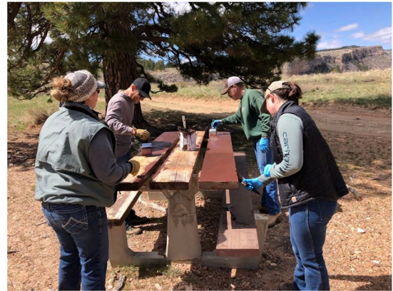
Painting new picnic table

The Outlaw Cave Campground, a first-come, first-served primitive campground, sits at the top of the Middle Fork Powder River Canyon, offering stunning views and a foot trail to the river. The tables at the Outlaw Cave Campground had been in need of repair and replacement for several years. In FY21, the Buffalo Field Office purchased and painted 25 boards for picnic tables and benches for picnic table repair. The project was completed in spring 2022.