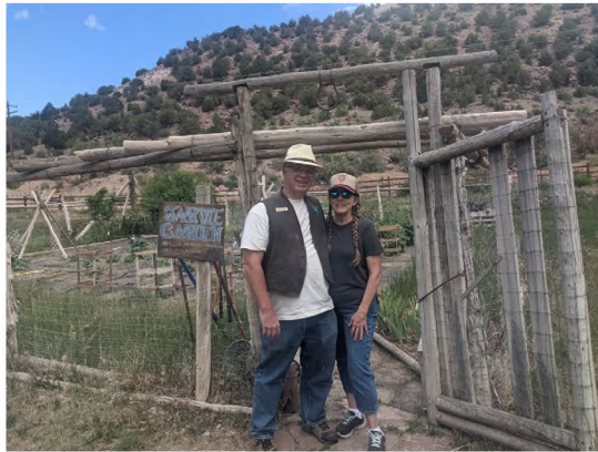
Brown's Park Campground Hosts

The Vernal Field Office (VFO) recruited volunteer campground hosts to assist the BLM in providing visitor services in Brown's Park. In addition to providing janitorial and maintenance at the Indian Crossing and Bridge Hollow Campgrounds, the camp hosts also worked at the Historic John Jarvie Ranch. The volunteers, both retired educators, interacted with the public, provided information to visitors, and gave interpretive tours of the facility while serving as the face of the BLM at the historic site.