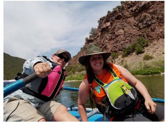
Monitoring the Green River Service First Agreement

Since 2016, the VFO has been working with the USDA Forest Service to manage the Green River under the Service First Program. This agreement has led to the creation of a management strategy to share staff time, resources, and personnel to provide a visitor experience that is seamless to the public and benefits both agencies.