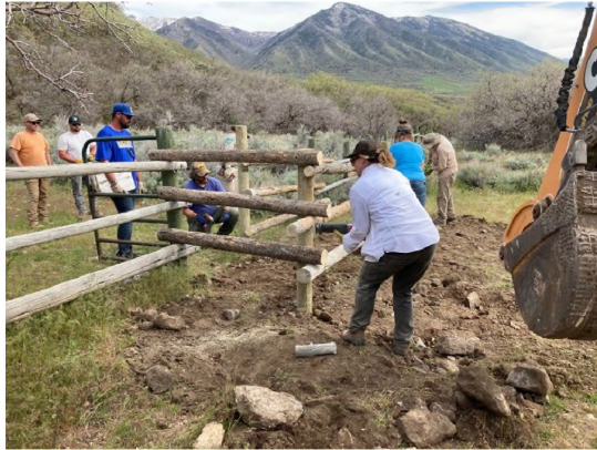
Salt Lake Field Office Staff Build Horse Gate

Salt Lake Field Office (SLFO) employees installed vehicle access gates, horse stepover gates, and fencelines in the North Oquirrh Management Area (NOMA). The total cost of the project was $31,000, with $9,000 covered by 1232 fees for the labor for 18 staff and some materials/supplies. NOMA is a dispersed recreation site located within the urban interface for the city of Tooele. It is popular for hiking, mountain biking, OHV riding, horseback riding, and wildlife and petroglyph viewing.