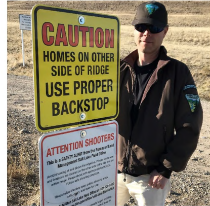
New Year-Round Park Ranger in Action

The SLFO has added a new year-round park ranger to its recreation team. The position is primarily funded with $45,000 in 1232 recreation fees and will be our on-the-ground visitor assistance and public outreach contact—providing invaluable assistance to the SLFO outdoor recreation planners and law enforcement rangers in the management of recreation resources for more than 1 million annual visitors on over 3 million acres of public lands.