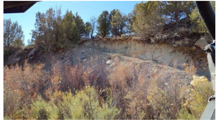
Trail Section Improved in FY22

In FY22, the MtFO made major strides in implementing the Recapture off-highway vehicle (OHV) trails project. This included grading and delineating parking areas as well as improving trails to make them safe and easy to follow. Next steps in this project include working with local OHV enthusiasts to develop and post permanent trailhead signage to emphasize Tread Lightly! and Visit with Respect information.