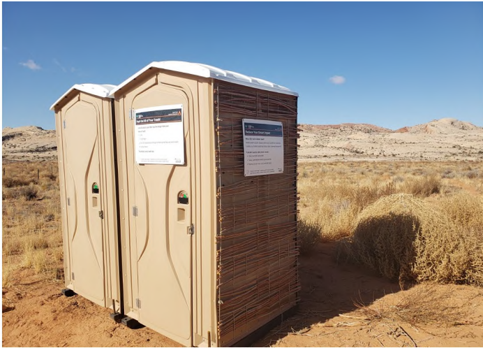
Portable Toilets Protect Resources During Planning

In FY23, the MtFO has entered into an assistance agreement with the Bears Ears Partnership (BEP, formerly Friends of Cedar Mesa) to enhance recreation experiences within the Bears Ears National Monument (BENM). The project includes developing and printing interpretive materials such as signs and maps, contracting with the Ancestral Lands Corps (ALC, a Native Youth Conservation Corps) to maintain trails and improve trailheads, and purchasing and installing portable toilets in key locations where visitation has outpaced facility development. In addition to visitor safety and convenience, these projects protect the irreplaceable cultural resources of BENM with visitor education.