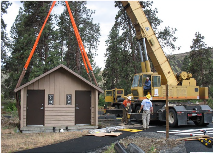
New outhouse installation