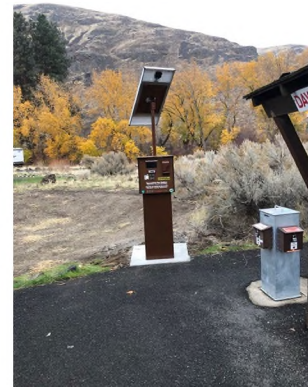
New Umtanum ROK

The BLM WFO installed a Remote Offgrid Kiosk (ROK) remote pay station unit at the Umtanum Recreation Site in the Yakima River Canyon of central Washington state on May 11, 2022. The Umtanum ROK is the second ROK unit that BLM has installed in the Yakima River Canyon (Roza was the first location in 2021). Both ROK units have been popular with the public, who have appreciated another option to pay the BLM site use fees. ROK unit cost: $7,000 + $2,500 annual service fee.