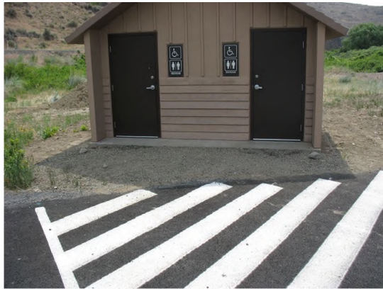
Big Pines Outhouse

The BLM Wenatchee Field Office (WFO) spends recreation fee money each year on a contract to pump outhouses at BLM’s four Yakima River Canyon recreation sites and Liberty campground, a total of 16 outhouses. Outhouses are pumped twice per year by a local contractor at a cost of approximately $22,000/year. This “must do” contract is one example of the maintenance and operations projects accomplished using recreation fee money, keeping sites running smoothly.