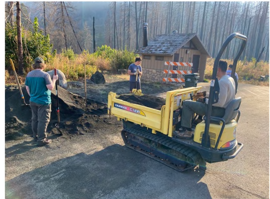
Park Ranger Support for Volunteers

The Roseburg District funded one Park Ranger with the use of collected recreation fees. The Park Ranger provided regular patrols and usage monitoring of the District's campgrounds and recreation sites. They also provided coordination and logistical support for multiple community volunteer clean up and National Public Lands Day events. Fee dollars supported staff time for restoration of popular campgrounds and trails, including Susan Creek Campground and Falls Trail.