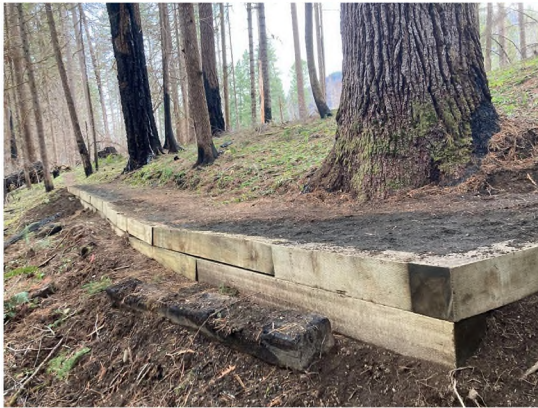
Retaining Wall Reconstruction

Collected recreation fees helped fund the restoration of trail retaining walls along the loop trail at Susan Creek Campground and supported maintenance worker staff time. Staff time provided oversight to South Coast Business Crew and additional maintenance crew support. Recreation fees supported testing and repairs to water systems and deferred maintenance at multiple sites. Extensive re-gravelling was done within campsites and along trails around Susan Creek and Susan Creek Falls Trail.