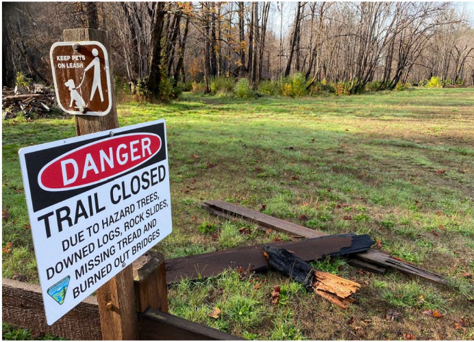
Recreation site improvements

The Roseburg District will continue to focus on Archie Creek Fire Recovery activities, while moving forward on multiple planning efforts to improve recreation opportunities within the North Umpqua, Rock Creek, and Little River corridors. Collected recreation fees will support the following activities: