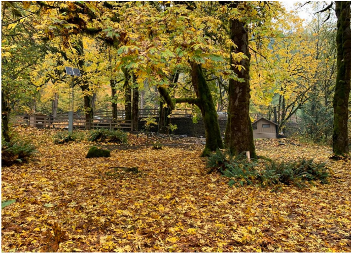
Elk Bend solar panel array to replace and move