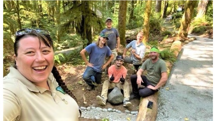
Youth Crew and Recreation Staff Repair Trail

Northwest Oregon District Park Rangers and local volunteers from Ant Farm Youth Crew restored the Salmon River Trail located in Wildwood Recreation Site in Welches, Oregon. Nearly 2 years ago, a tree fell on the raised boardwalk rendering it unsafe for public use. Ant Farm dismantled the remaining boardwalk, smoothed out the pathway, added gravel, and transplanted vegetation.