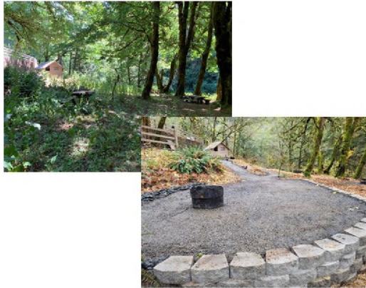
Accessible Campsite in Elk Bend Group Campground

Elk Bend Recreation Site opened to the public for reservations on May 13, 2022, thanks to the hard work of District recreation staff and a Tillamook Field Office workday. The overhaul included planting over 200 trees and shrubs, and the installation of protective fencing and site amenities. Located along the newly designated Nestucca Wild and Scenic River, Elk Bend Group Campground has five individual campsites, which include one accessible site, a central fire ring, vault toilet, and seasonal water.