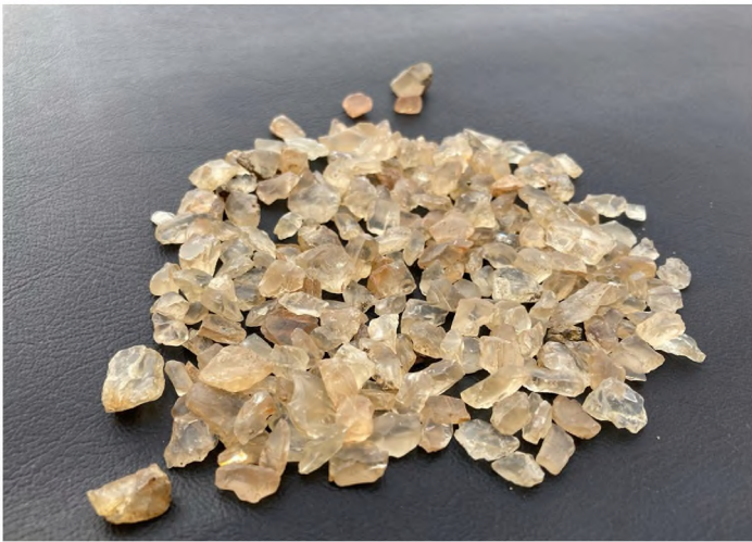
Sunstones collected by visitors

Purchase and install new accessible vault toilets at Sunstone Public Collection Area and Hart Bar Day Use Site. Funds have been saved for larger projects - $60,000