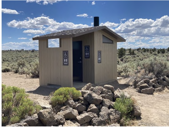
Newly installed vault toilet

Crack-In-The-Ground is one of the Lakeview Field Office's most popular recreation sites. With the increase in visitation, replacement of the old vault toilet became necessary. Using a variety of funds including recreation fee funds, the old vault was demolished and replaced in 2022. Contractors also installed a new informational kiosk at the site. This project was the first of four vault toilets that are planned to be replaced.