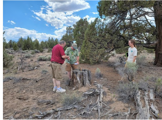
Geocachers and BLM Park Ranger at Stumpied geocache

The Christmas Valley Back Country Byway GeoTour officially launched on June 29, 2022, to coincide with the 33rd anniversary of the Byway's designation. Over the July 4th weekend, approximately 300 experienced and new geocachers traveled to North Lake County, Oregon, to try and complete the 28-cache GeoTour. Since its launch, the Tour continues to be a success, with cachers out most weekends and coming from as far away as Germany to participate.