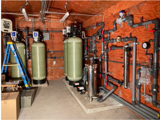
The new water treatment facility at Loon Lake.

The Loon Lake Recreation Site reopened for the 2022 season with new facilities. The BLM used funds to purchase and construct the water treatment system, maintenance building, and restroom after the original buildings were destroyed in a 2019 snowstorm. The water treatment system is a complete upgrade while the new restroom allows for continued access to facilities. The new buildings enhanced visitor enjoyment, health, and safety.