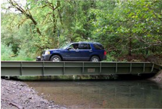
Edson Creek Campground bridge.