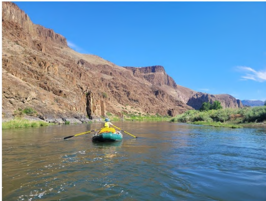
117 Wild and Scenic River miles inventoried

River rangers inventoried campsites along the John Day Wild and Scenic River in preparation for an updated boater's guide. Rangers collected GPS points, photographs, and campsite condition data at historically inventoried sites within the 117 miles of river between Service Creek and Cottonwood. Staff also inventoried new sites and collected additional information that might be helpful for future boaters.