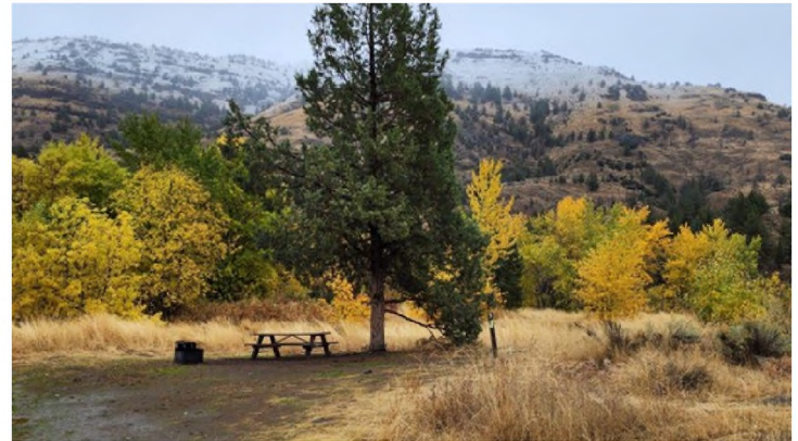
Rangers caring for recreation sites

Rangers oversaw the maintenance and care of developed and non-developed recreation sites along the John Day Wild and Scenic River and the North Fork of the John Day River. Rangers removed over 4,300 pounds of garbage, 135 piles of toilet paper, and 122 unauthorized fire rings. Staff controlled weeds and cleared overgrown vegetation. Rangers also provided information and assistance to recreators while checking boater permits at launch sites.